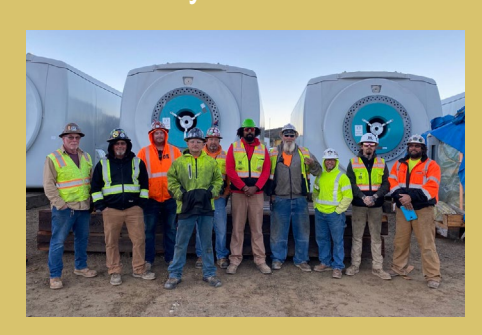
A few of our veterans gathered for a photo on our Lompoc wind project.

Employing US Veterans is something Mountain takes great pride in. The skill, commitment and dedication shown by these great men and women have undoubtedly lifted our company to be better and serve our clients better. Each year we take the opportunity on Veterans Day to recognize the great sacrifice they have made for our country.