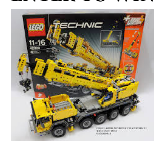
Enter to win A LEGO Technic Mobile Crane!