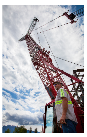
Inside this Issue: