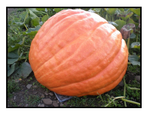
Enter to win

Whether you want it for yourself, kids, or grandkids, this is a pretty good opportunity to celebrate Halloween in style!