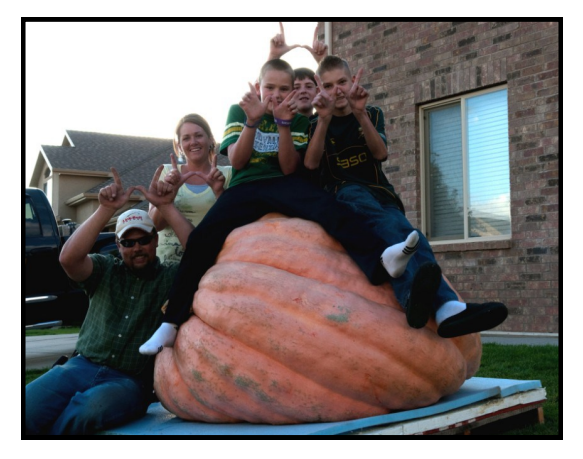
Winners and size of last year's giveaway pumpkin