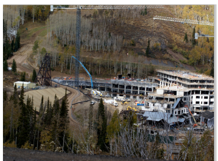
Click here for the Historic Site Form