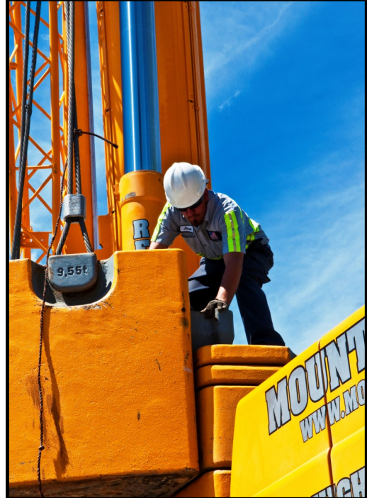
Top: Mountain Crane emblem created to represent the Mountain Crane Law.

The law states that the company will 1) arrive on time AND finish on time 2) will have ALL the information and equipment required to complete the job and 3) will be compliant with its own stringent safety standards as well as those of the customer.