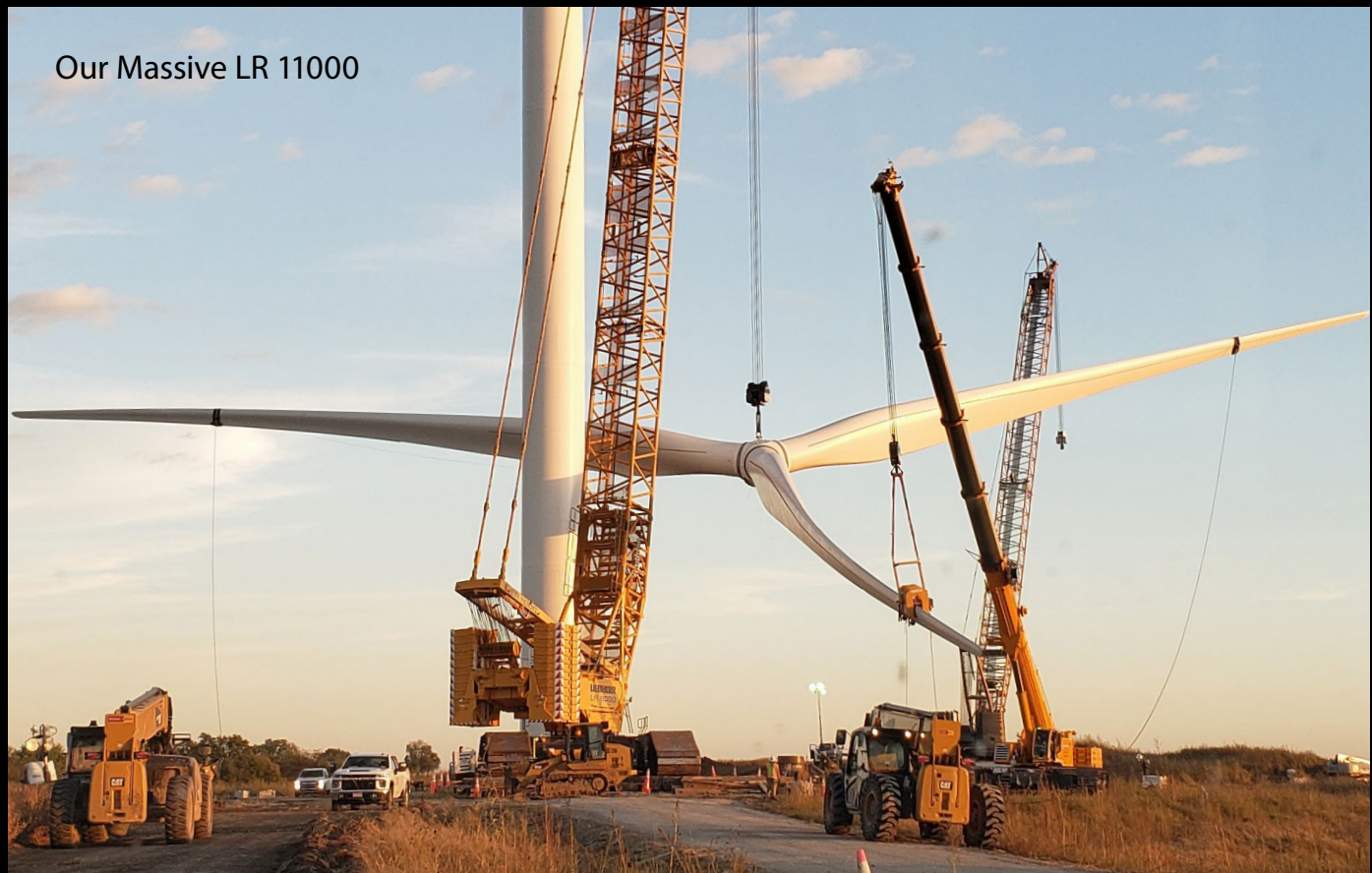
Our Massive LR 11000